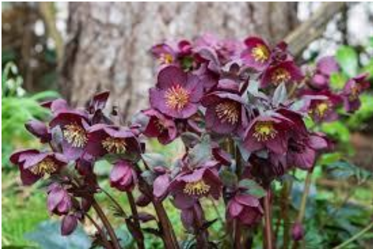
The Lenten Rose