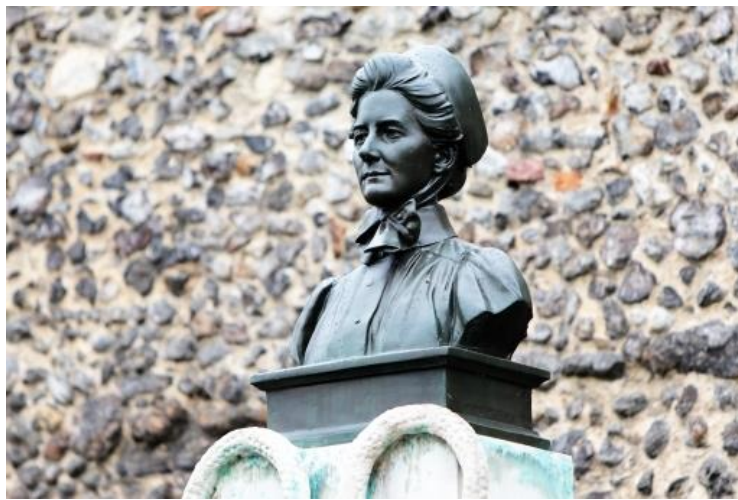
Memorial in the grounds of Norwich cathedral