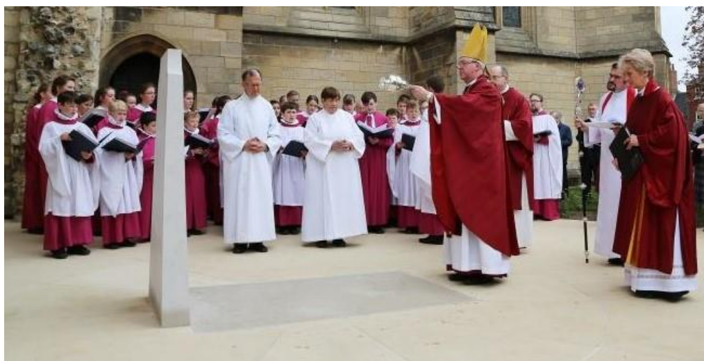
Dedication of Edith Cavell's new grave in 2016